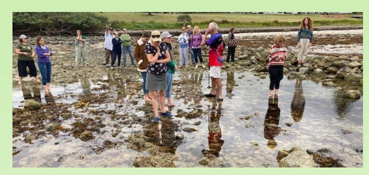
Project Description: 0.4 EFT Landcare Coordinator

The NSW Landcare Program is a partnership between Local Land Services and Landcare NSW. It builds on a number of previous Landcare Support Programs, the Local Landcare Coordinator Initiative and Regional investment made through National Landcare Program and catchment Action. The programs purpose is to play a role in empowering local Landcare volunteers by contributing to the systems, partnerships and structures that underpin their capacity to achieve outcomes.