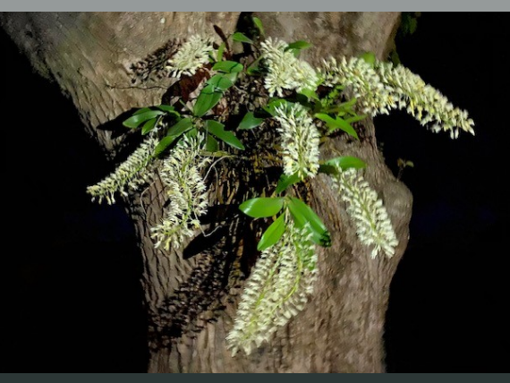
WORKING TOWARD THIS OBJECTIVE BY